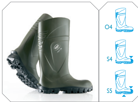
Steplite ® X green - ref. X2100/9180 (O4) - ref. X2300/9180 (S4) - ref. X2400/9180 (S5)